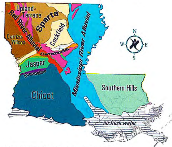
Approximate surface extent of major Louisiana aquifers. Adapted from map sources: USGS/LDOTD Guide to Louisiana's Ground-Water Resources, 1994; LDEQ and USGS Aquifer shapefiles.

Louisiana has two major alluvial aquifer systems , with recharge areas generated by the Red River and the Mississippi River as well as by rainfall and infiltration from other aquifer systems. Although some water from these aquifer systems is of good quality, geologists have found that not all water is suitable for untreated private water wells due to naturally-occurring contaminants. Localized areas of these aquifers have been shown to contain concerning levels of arsenic , secondary contaminants and other problems. 2 Arsenic can cause serious acute and chronic health issues, ranging from developmental to neurologic or carcinogenic effects.